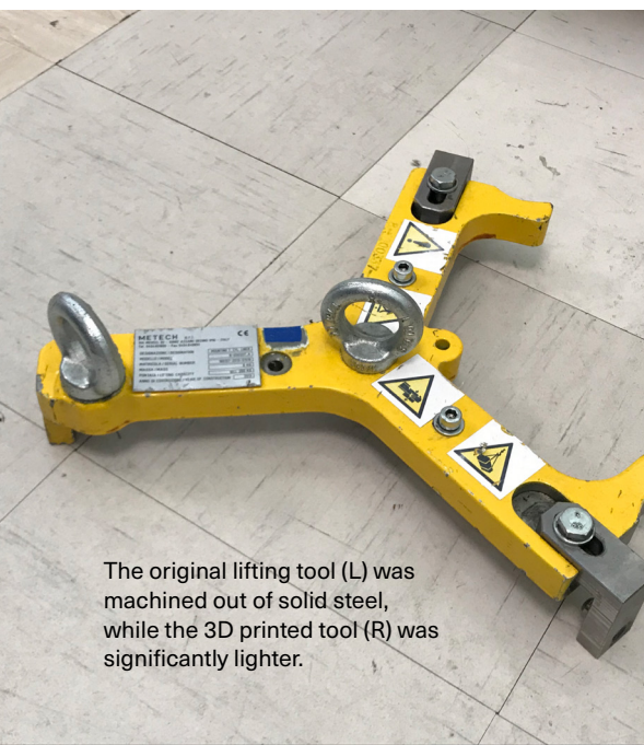
The original lifting tool (L) was machined out of solid steel, while the 3D printed tool (R) was significantly lighter.

JUHO RAUKOLA INNOVATION EXPERT (ADDITIVE MANUFACTURING), WÄRTSILÄ