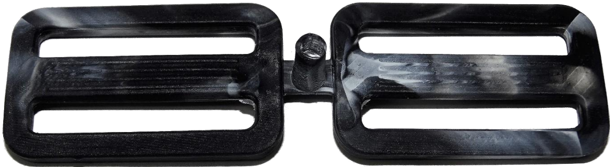
Figure 4: 15 th recycled PP part from 3D-printed mold.

Extended use of the mold and the best processing conditions are currently under investigation by the researchers. Previous studies by Liqcreate and partners resulted the use of more than 300 successful parts. The researchers concluded that.