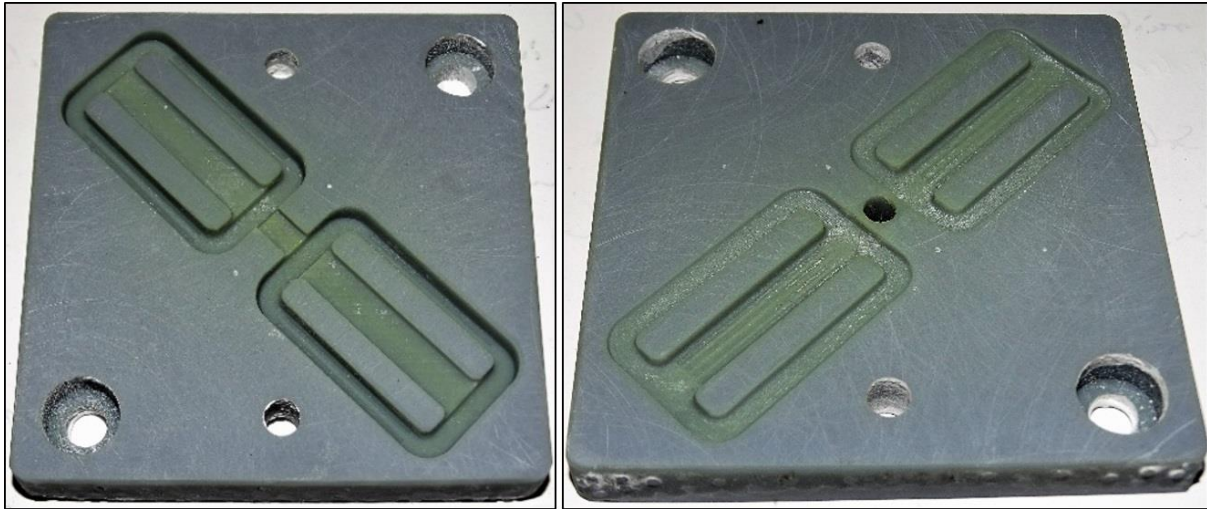
Figure 3: 3D-printed mold in Strong-X resin after 15 shots of recycled PP at 200 °C injection temperature. The mold was designed by HolyPoly for functional prototype testing and color sampling.